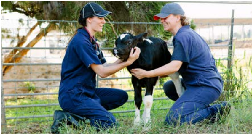
Bachelor of Veterinary Science students with a calf.

Class sign-ons for science open from 8:30am Tuesday 22 January . Be prepared with your preferred choices prior to sign-on opening as classes, particularly practicals and tutorials, can fill up very quickly (sometimes within 10 minutes of opening!). Prepare a plan B ahead of sign-on, with alternative class times.