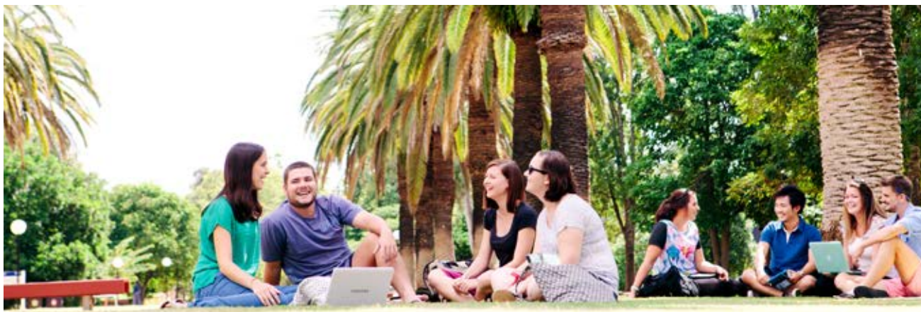
The Central Walkway at UQ Gatton campus.