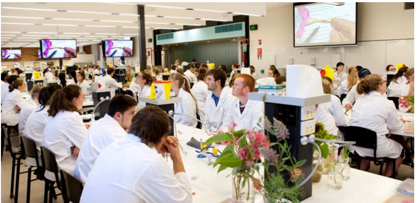
First year students in science laboratories at UQ Gatton.