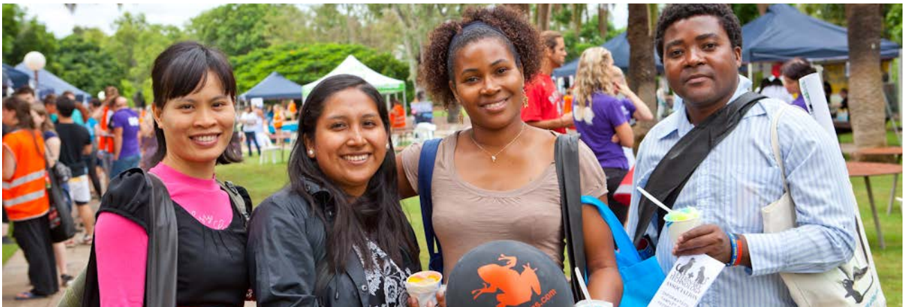
Market Day in Orientation Week at UQ Gatton campus.

Assistants will be available: Monday - Friday of Orientation Week 8.30am - 4.30pm Student Centre N.W. Briton Building Annexe 8101A, Gatton