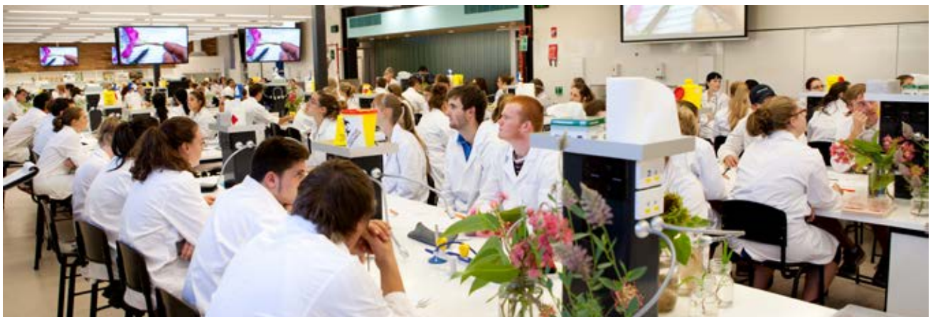
First year students in science laboratories at UQ Gatton.